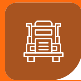
TRUCK AND TRAILERS